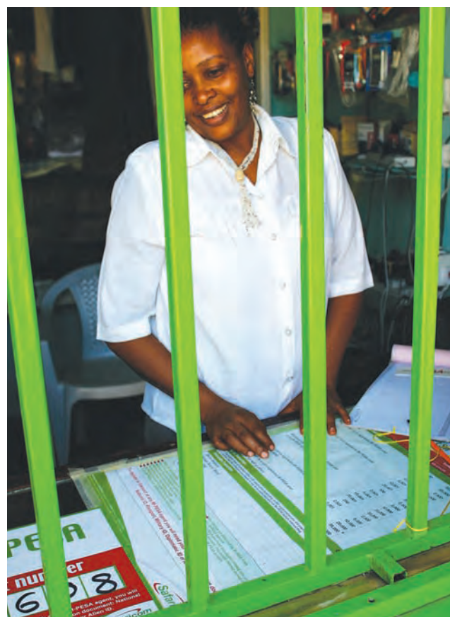
An M-PESA agent tends her clients with her agent number, policies, and prices clearly and simply displayed for customers' view.