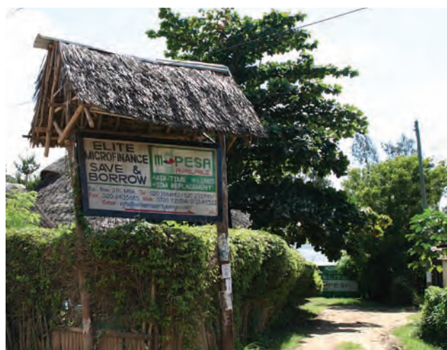
A small MFI in Mtwapa also serves as an M-PESA agent.

Consumers were unafraid of asking questions and seeking answers, and reported elaborate stories for seeking redress after every negative experience with a financial service provider. 9 In fact, consumers seemed to believe that M-PESA agents were just as or more helpful than bank tellers, since you can ask your questions more quickly, and agents are not too hurried to move on to the next person in a long queue of waiting customers. Consumers felt banks were usually more able to rectify problems, but were generally less accessible. 10