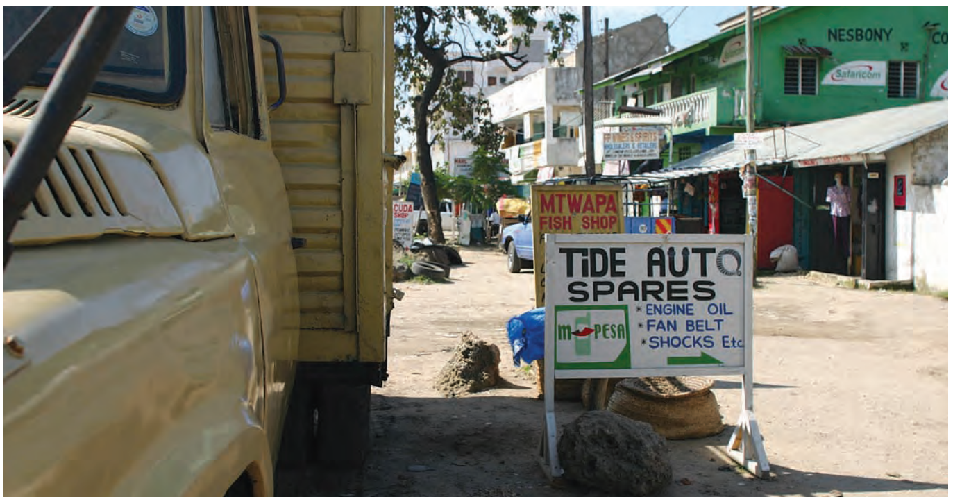
M-PESA services are offered at independent agent shops or as an add-on services for a large range of other types of businesses.

feel they've been wronged or cheated, they are often quick to walk away. Increasing financial inclusion necessitates not just bringing the poor into formal financial services, but ensuring that they are not driven out by these kinds of disappointments.