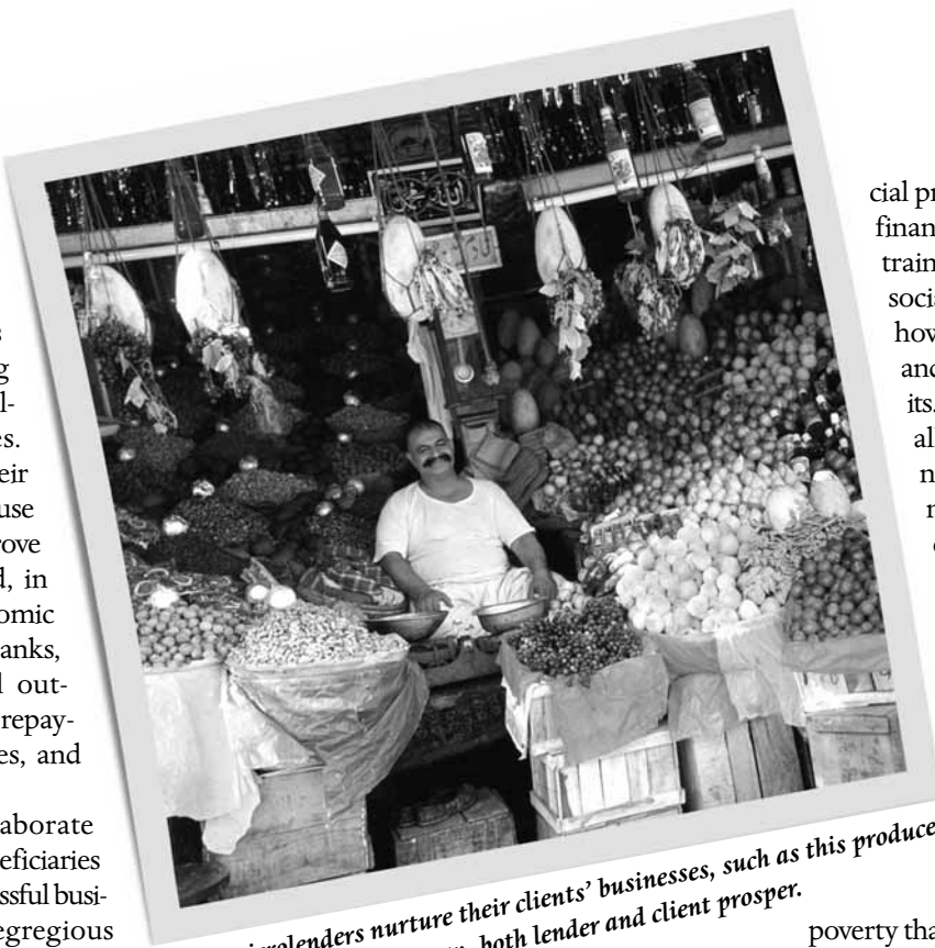
When microlenders nurture their clients' businesses, such as this produce stand in Peshawar, Pakistan, both lender and client prosper.