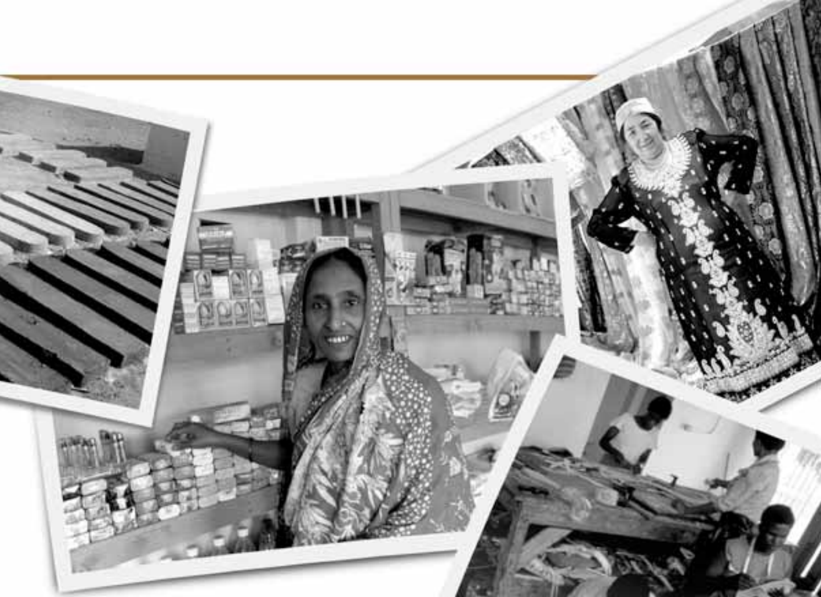
Microloans have launched businesses as diverse as concrete casters in India (top left), clothes shops in China (top right), grocery stores in Bangladesh (above), and shoe factories in Botswana (bottom right).

work, for whom it could work, where it could work, or when it could work. In other words, few MFIs have explicitly formulated their theory of change – that is, an explanation of how their activities could lead to their desired outcomes. Without a clear theory of change, these MFIs invest resources, launch programs, and track outcomes that have little to do with their ultimate goals.